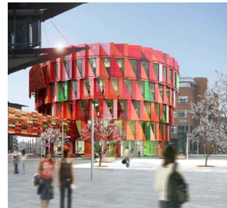
Kuggen, Miljöbyggnad, GOLD

Conceals individual results Bias conclusions Is generally not possible to influence